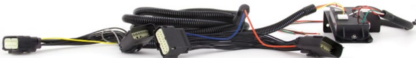
Solid State, Plug-In Headlight Flasher ETHFFUT-16