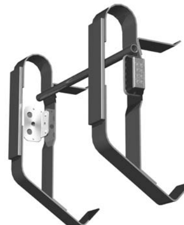
Alternate mounting method to strap steel type push bumper.

WARNING: Warning devices are strictly regulated and governed by Federal, State and Municipal ordinances. These devices shall be used ONLY on approved vehicles. It is the sole responsibility of the user of these devices to ensure compliance.