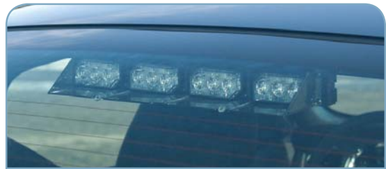
4 Module Suction Cup Mount UltraLITE™ shown mounted in the rear window of a Ford Mustang.