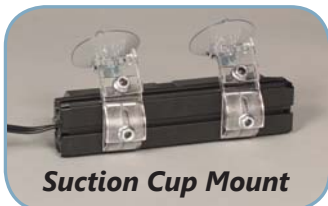
Suction Cup Mount