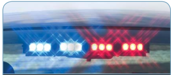
4 Module Suction Cup Mount UltraLITE™ in Red/Blue shown illuminated on a bright day.