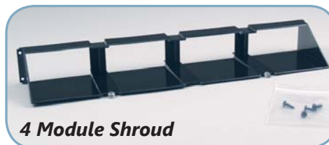
4 Module Shroud

UltraLITE Interior & Exterior Directional/Warning Bars, see pages 21 - 22