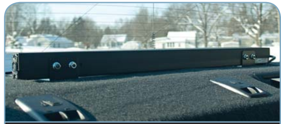
Shroud can be removed from light & used with a variety of optional brackets for a custom mount, see pg 23.