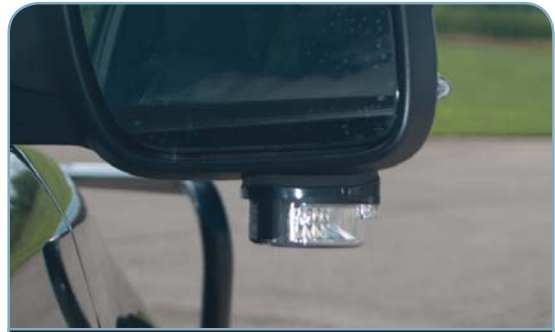
Intersecor™ shown mounted under the mirror on a 2011 Ford Explorer for police use.