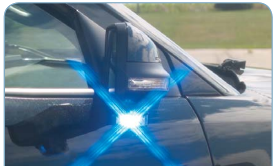
Blue Intersecor™ shown illuminated on a bright day. Light offers uncompromised mid-level lighting.