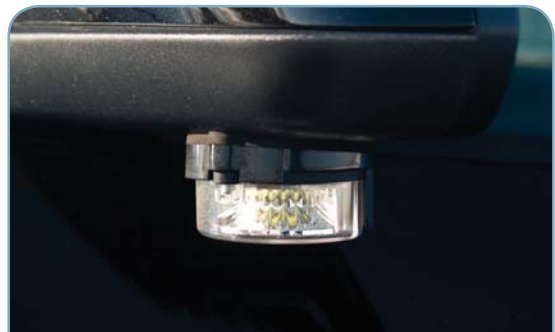
Designed with internal reflector to amplify the light output for increased visibility at dangerous intersections.