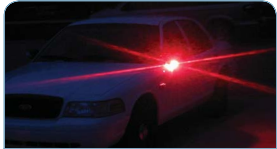
Unique mount & special design angles & amplifies the output for heightened visibility at intersections.