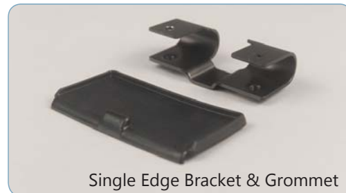
Single Edge Bracket & Grommet