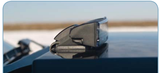
Single Light in Black Edge Mounted to the hood on a Ford Mustang police vehicle.