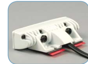
3M Super Duty Adhesive Mount