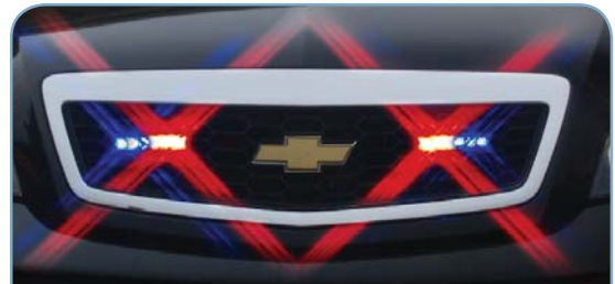
Two GHOST™ lights in Red/Blue (J) mounted inside the grille of an undercover Chevrolet Caprice.