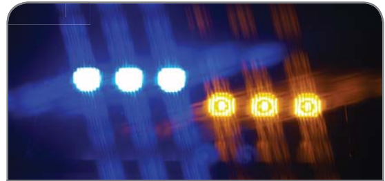
Dual light offers unique, attention grabbing “X Patterns” - upper 3 diodes flash against opposite lower 3 diodes.