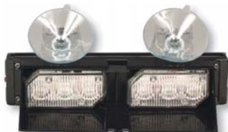
2 Module Light