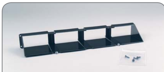
Universal shroud mounts flush against windshield to reduce flashback. 4 Module Shroud, #PUL3WSS shown.