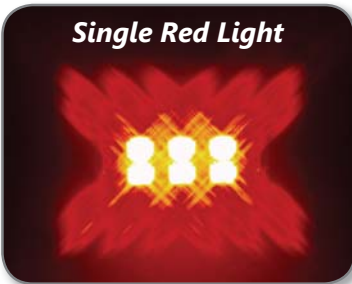
Single Red Light