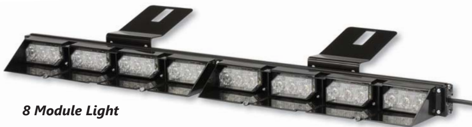
8 Module Light