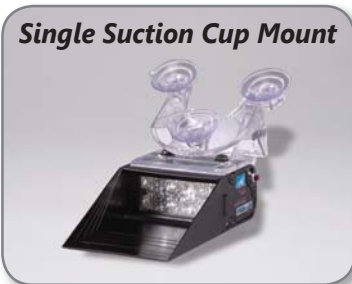
Single Suction Cup Mount