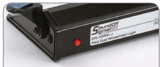
Light has convenient, quick access rear switch for Flash Pattern change & powering on or off.