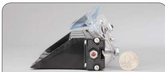
Side of Suction Cup Mount light shown. Red Switch is the On/Off button. 8 & 12 Module lengths are hard wired.