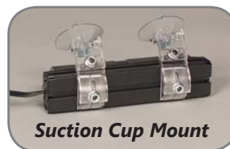
Suction Cup Mount

See opposite page for Parts & Accessories.