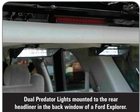
Dual Predator Lights mounted to the rear headliner in the back window of a Ford Explorer.