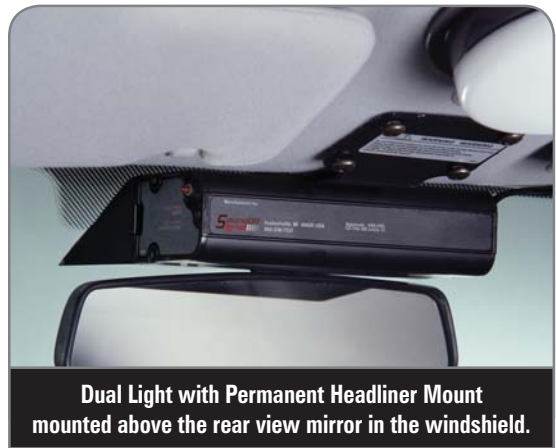
Dual Light with Permanent Headliner Mount mounted above the rear view mirror in the windshield.