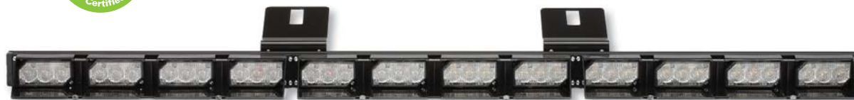
12 Module Light

UltraLITE Interior or Exterior Directional/Warning Bars, see pages 21 - 22