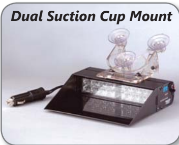
Dual Suction Cup Mount