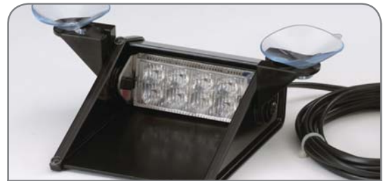
Lights include Suction Cup Mount with adjustable brackets & 11.5’ cord with 12v cigar plug (single shown)