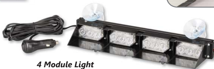
4 Module Light