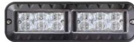
Predator™ LED Warning Dual Side-by-Side Surface Mount in Black or White Finish