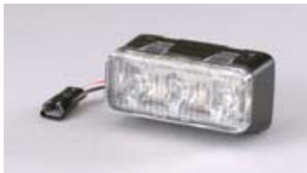
LED3 mini warning surface mount light w/ low profile and small size