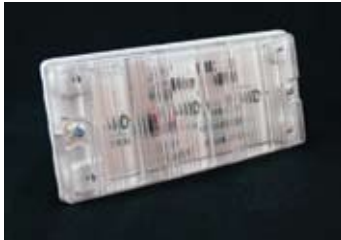
LED interior school bus style rectangular dome light & compartment light (surface mount)