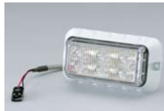
Predator™ LED Warning Single Surface Mount in Black or White finish