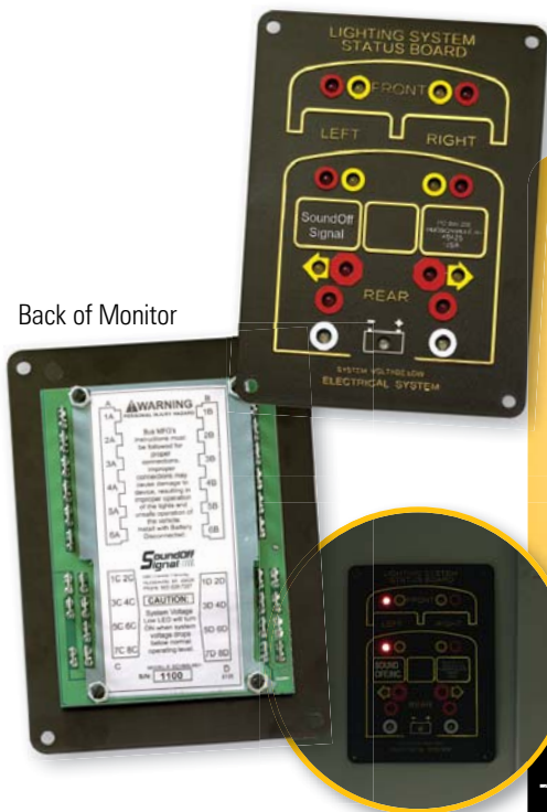
Back of Monitor