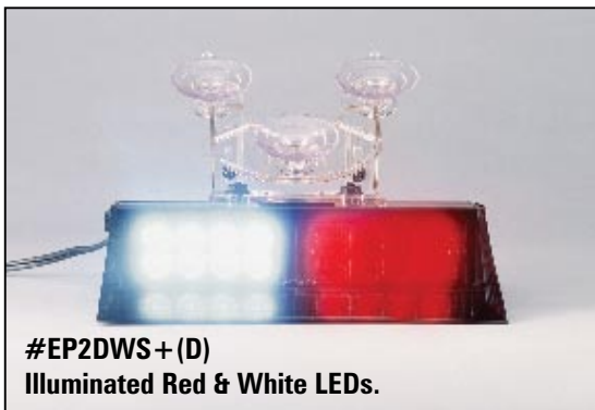
#EP2DWS+(D) Illuminated Red & White LEDs.