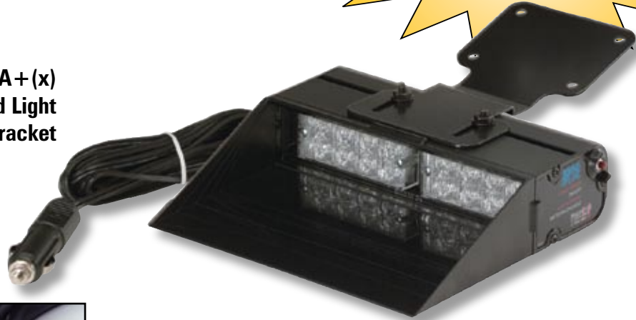
EP2DWSA+(x) Predator 2™ Dual Windshield Light w/ Permanent Mount Headliner Bracket

You asked, we listened! New Part Number for Light w/ Headliner Bracket