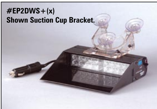
#EP2DWS+(x) Shown Suction Cup Bracket.