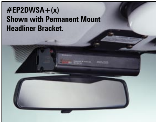
#EP2DWSA+(x) Shown with Permanent Mount Headliner Bracket.