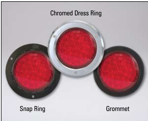
Chromed Dress Ring