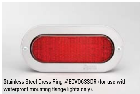
Stainless Steel Dress Ring #ECVO6SSDR (for use with waterproof mounting flange lights only).

Waterproof Mounting Flange is available on our standard and LD Series STT, FPT and Backup/Reverse lights.