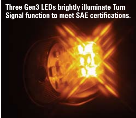
Three Gen3 LEDs brightly illuminate Turn Signal function to meet SAE certifications.