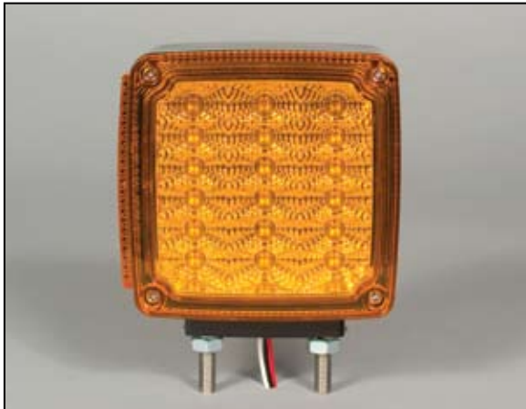
Light is available as a Universal Mount with Amber Front/Amber Rear. Also available in a Road Side or Curb Side Mount with Amber Front/Red Rear.