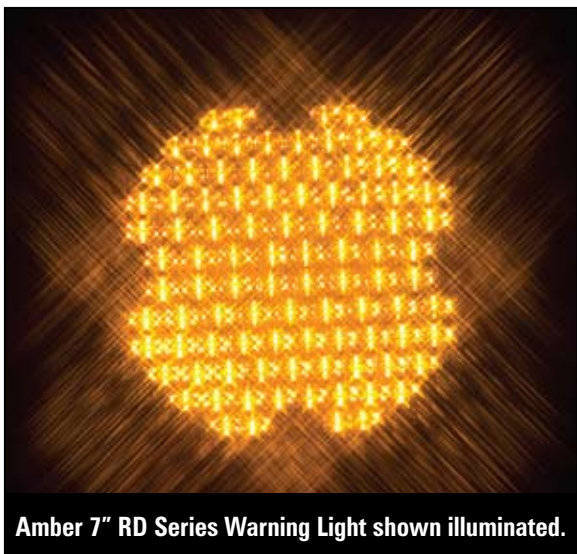
Amber 7" RD Series Warning Light shown illuminated.

7" Round RD Series LED Warning Lights #E756IEBØA-RD Amber #E756IEBØR-RD Red